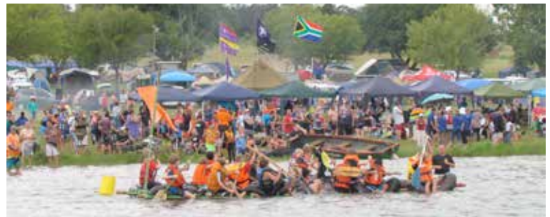
Hundreds of family and friends line the banks shouting words of encouragement to their teams.

Well done to 1st New Germany and all the many helpers on organising another resounding successful raft race!